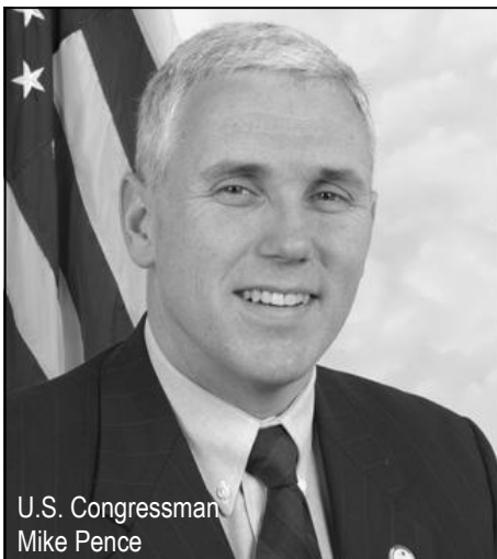
U.S. Congressman Mike Pence

The time has come to deny any and all federal funding to Planned Parenthood Federation of America.