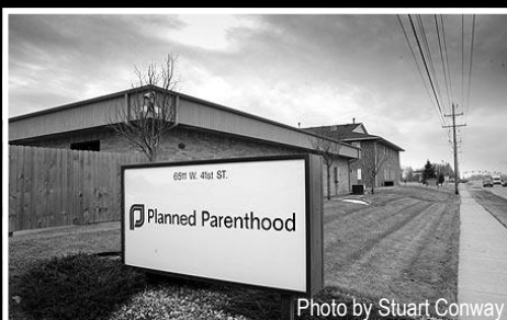
Planned Parenthood of Sioux Falls, South Dakota

On March 18, the U.S. House of Representatives voted to de-fund Planned Parenthood for this fiscal year. SD Rep. Kristi Noem joined the majority in passing the measure 240-185. Please contact Rep. Noem and thank her for standing up for life!