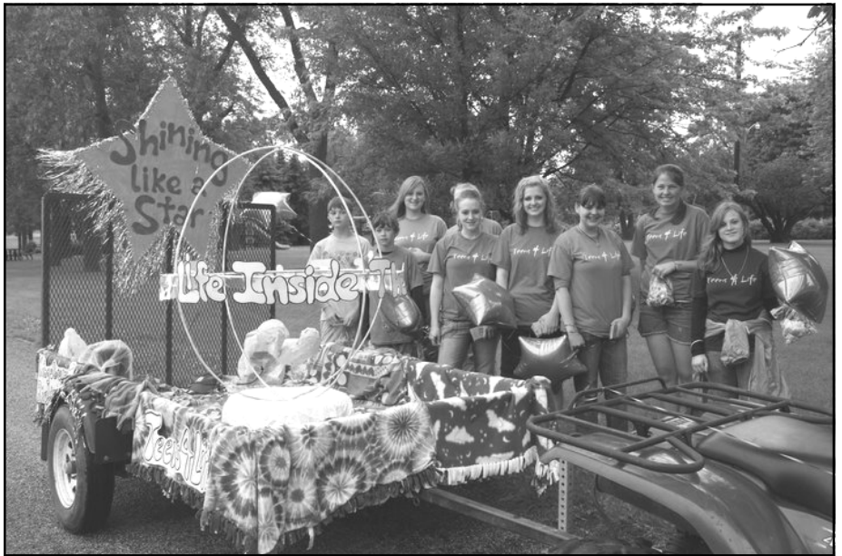
The De Smet Teens 4 Life pose by their 2010 Settlers Day parade float. Check them out on their new Facebook page, De Smet Teens 4 Life.

have not forgotten, and if pro-lifers have anything to say about it, the President will be reminded in about nineteen months.